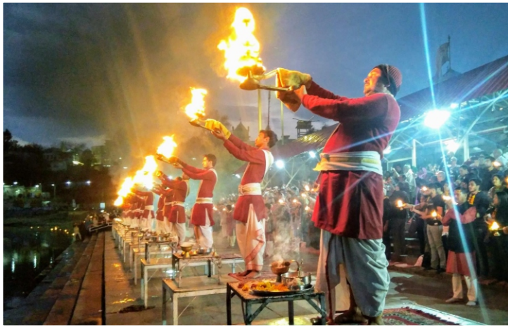
Ganga Arti at Triveni Ghat